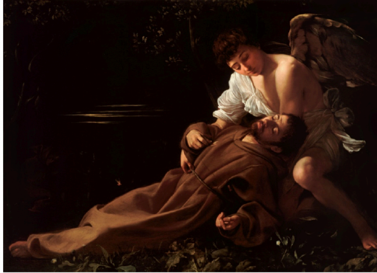
Saint Francis of Assisi in Ecstasy, Caravaggio c. 1595

Even as we commemorate the 800 th anniversary of the death of Saint Francis, we marvel at the extraordinary number of faithful making pilgrimage to Assisi to pray before his relics, exposed for veneration for the first time since his death. And even now, as we remember the Francis who traveled to Egypt to meet with the Muslim Sultan during the fifth Crusade to encourage peace, we ourselves beg the Lord for peace in this, our time of war.